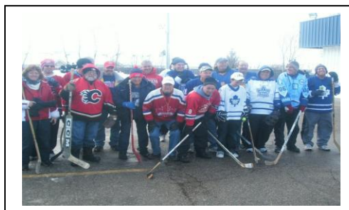
Hespeler Street Hockey 2011 at the Legion Sat. Feb. 12th

The Hespeler Library is offering an exciting program of free children's activities during March Break Mania Week , March 14 th to 18 th . All ages are welcome on a first come, first served basis; but children under 5 must be accompanied by an adult. Mon. is Pirate Pizzaz (10:30), Tues. is Yogi Bear's Picnic (10:30) and Mardi Parti (2:00), Wed. is Crazy for Colours (10:30) and Fancy Nancy Party (2:00), Thur. is Doodle Movers Clubhouse (10:30) and Monkey Business (2:00), Fri. rounds out the week with Box Builders (10:30). Mon. and Fri. mornings are craft programs, for more information call 519-658-4412 or go online at www.cambridgelibraries.ca .